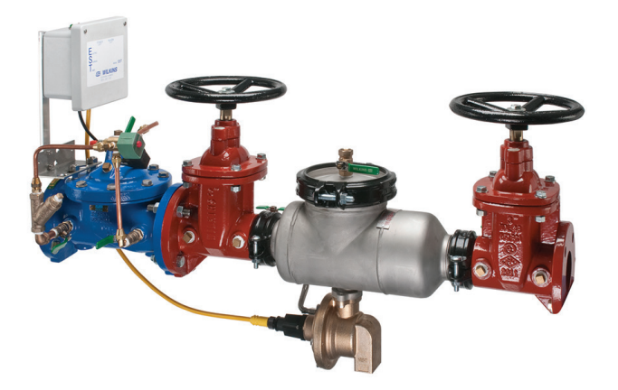
Flood Control Integrated System (FCIS) Stop the flooding before it starts. Protect your property from catastrophic flooding due to Relief Valve Discharge

For additional information, send for BF-375MS, BF-375AMS BF-475MS&VMS, BF-475&VMS212&3 and BF-FCIS